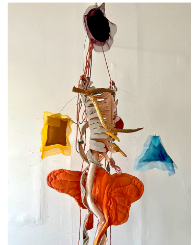
Joy Curtis Grandmas in other galaxies (detail), 2023 108 x 36 x 36 in