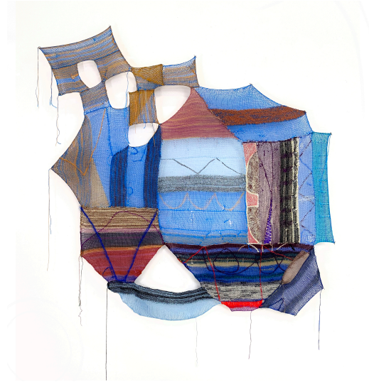
Melissa Dadourian Corner Grid, 2023 50 x 44 x 2 in