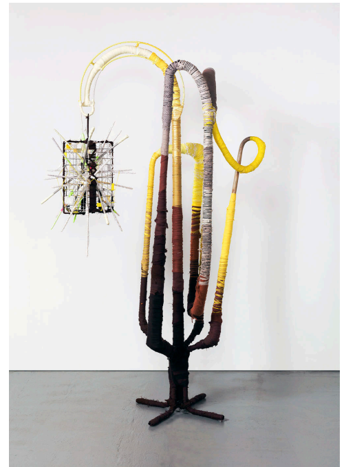
Courtney Puckett, The Lamplighter

These creations exemplify the profound revival of textiles as a potent and expressive medium. This exhibition delves into the current prevalence of fiber art in contemporary creations, a testament to the profound capabilities of this ancient craft. FIBRATION seeks to unveil textiles' rich possibilities and boundless potential as celebrated artists utilize these materials to push the boundaries of expression and craft new ways of knowing.