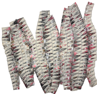
Regina Durante Jestrow Vulnerability & Resilience 2 34 x 31.5 in