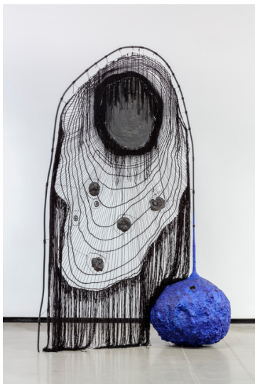
Michelle Segre Orbit of the Haggis, 2020 128 x 84 x 35 in